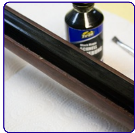
The gun barrel after the treatment with the Tifoo Black Magic Browning.