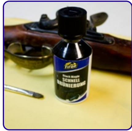
Black Magic Browning Tifoo

The following pictures show a typical example: Using Tifoo Black Magic is a perfect way for restoring a worn gun barrel easily and quickly.